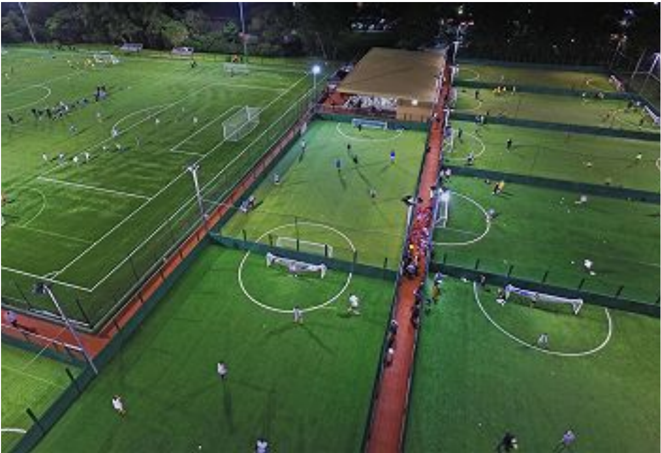
5SPORTS FOOTBALL CENTRE, ENDEAVOUR SPORTS HIGH SCHOOL, CARINGBAH