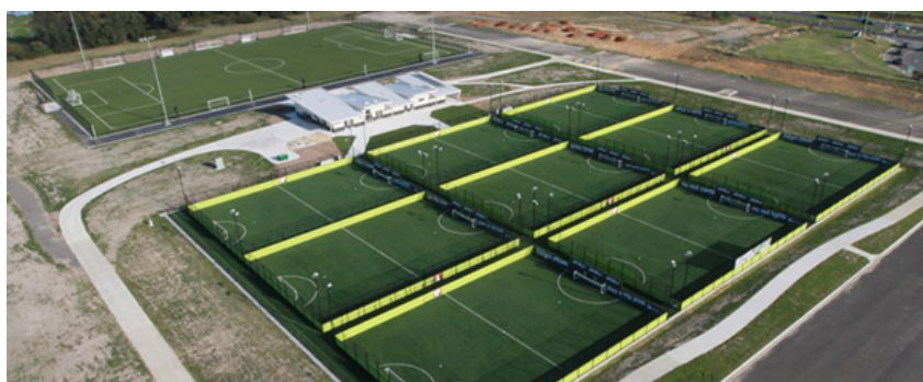
KNOX REGIONAL FOOTBALL CENTRE, VICTORIA

We feel that development of such a facility in the Eastern Suburbs would be a beacon for the game and have benefits that spread far beyond our nearly 9,000 players and their families. We feel that given the nature of benefits that could accrue, a project of this nature could attract support from other levels of government.